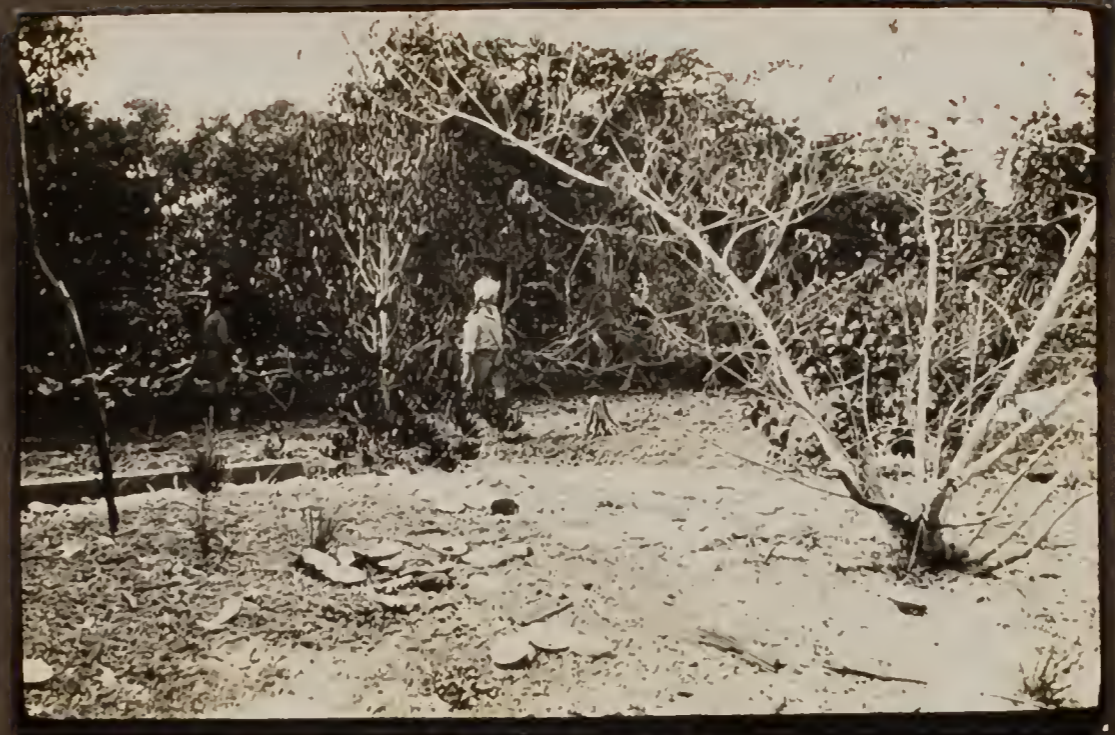
Remains of shell pit in swamp